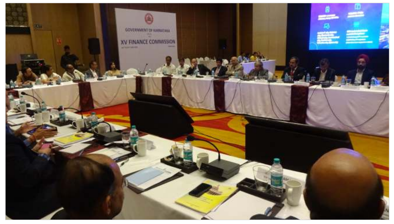
15th Finance Commission seeking inputs from industry captains

Bangalore Chamber of Industry and Commerce (BCIC) participated in the meeting convened by the 15th Finance Commission in Bangalore.