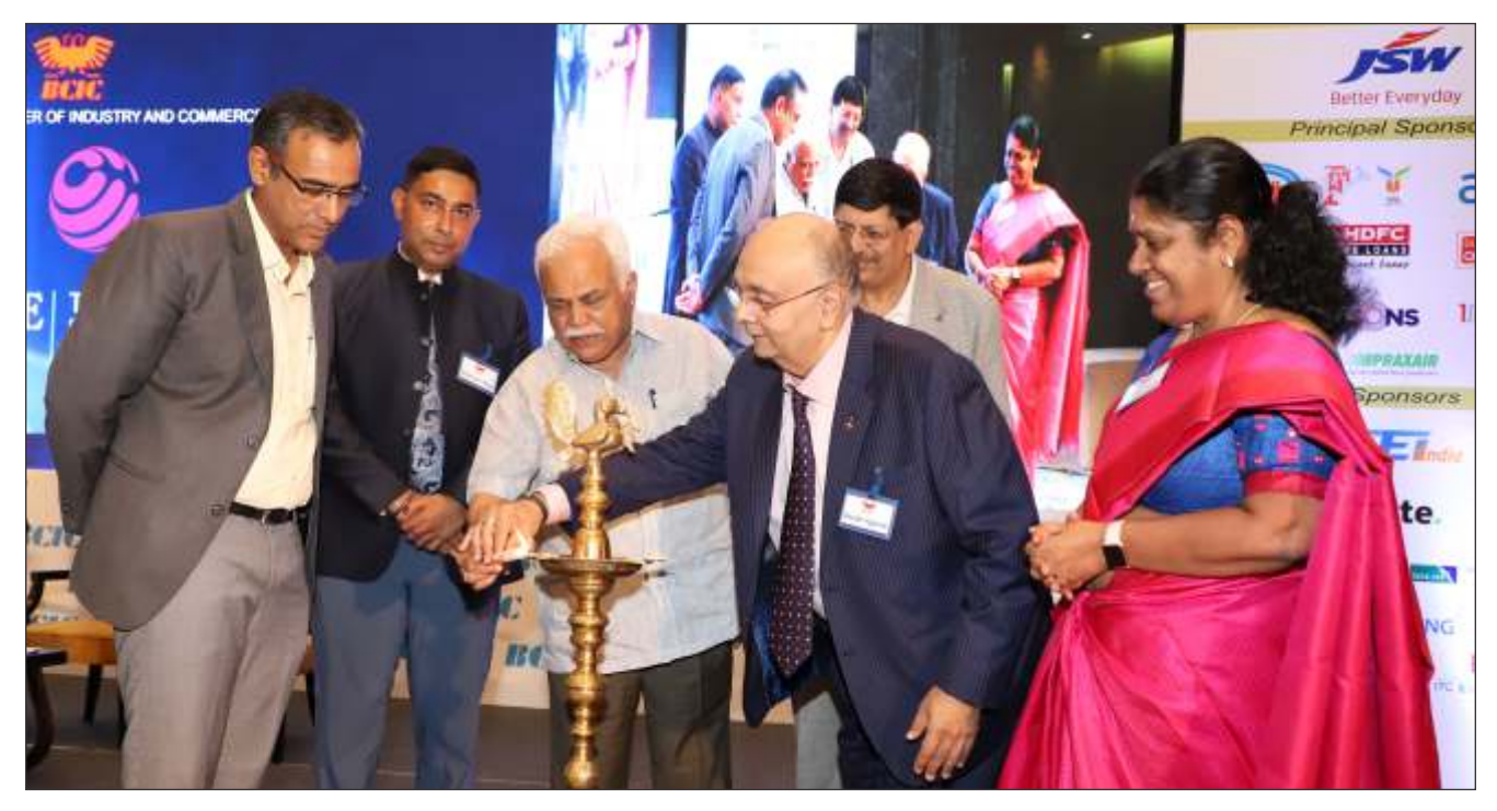
Shri. R V Deshpande, Minister for Revenue, GoK Inaugurating the AGM