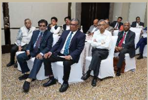
Past Presidents, Industry Captains and BCIC members at the AGM